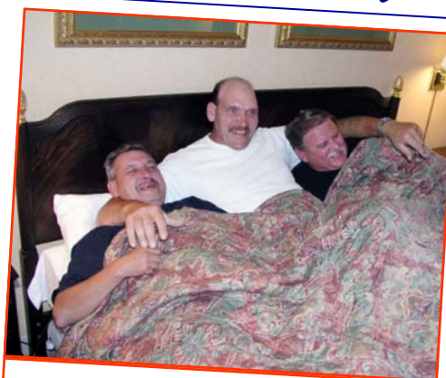
"Coosins" in a blanket

(Major continued from page 1) Wednesday, Thursday and Saturdays. The picture of me is with "Our Ambulance" They are called PEV's and we have 3 of them. Each PEV is actually a small semi that can transport up to 16 patients on a litter or stretcher and up to 12 ambulatory patients. The ride to and from Andrews AFB is about a 30 to 45 minutes. But when loaded with the soldiers we move with lights and sirens and usually make it in less then ½ hour. I am on board these PEV's with a medic and a tech.