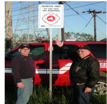
Recruitment & Retention Team members check out new signs in the District

"Since the announcement, our members have been very enthusiastic in speaking to residents about joining Doyle 1. We have developed several good leads from them. There efforts are key to making this campaign a success and is deeply appreciated."