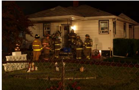
Doyle Firefighters Confine Fire to Basement

I want to take a minute to thank those who were able to make the basement fire last month on Peoria. A few key things came to mind with regard to the fire, manpower, and training. First, the most obvious thing that we need to work through is manpower. Even though our numbers are growing- time of day, day of week and season all play a role in how many firefighters we may have. It is easy to get discouraged when there are few members on scene, but knowing what your knowledge, skills and abilities provide can make a safe scene and still be effective. Being safe and effective at a scene also comes back to training. Training is much more than Wednesday night drill however. Training should occur every day and with everything you do. As you drive